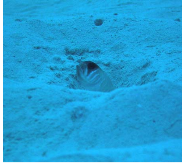
Figure 3. An unknown jawfish, Opistgnathus sp., was seen by a diver during a transect dive.