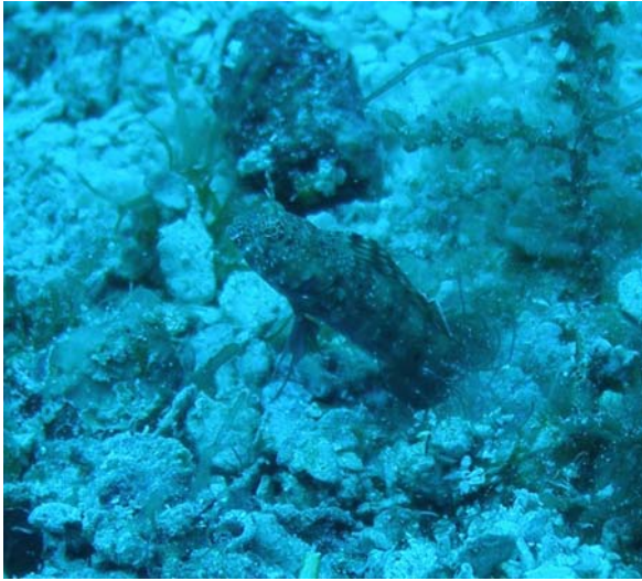
Figure 1. The sailfin blenny, Emblemaria pandionis , was observed for the first time on a transect dive during this St. John mission.