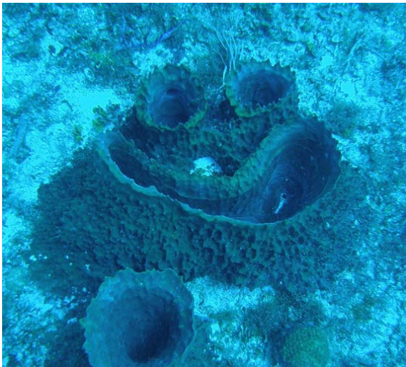
Figure 2. Barrel sponges make up this smiley face spotted during one of the survey dives in the MSR.